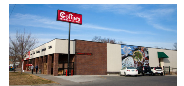
Thank you to Cottin’s Hardware for their generous donation of materials!