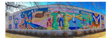
Seeds by Dave Loewenstein remains on our previous location at 9th & Mississippi in Lawrence.